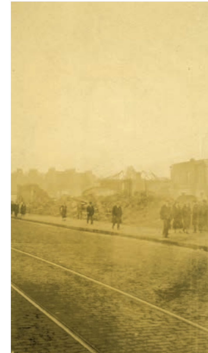
O'Connell Street, Upper, east side, July 1922 12/29V6