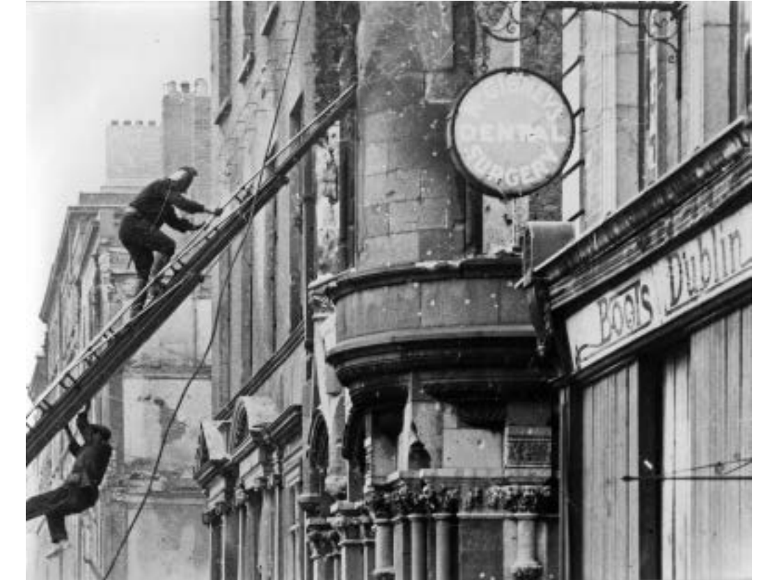
Dublin Unity Tramways Co. offices (formerly the Scottish Provincial Insurance Co.), 9 O'Connell Street, Upper, fire brigade in attendance, July 1922 IAA Photographic Collections, 51/4X2