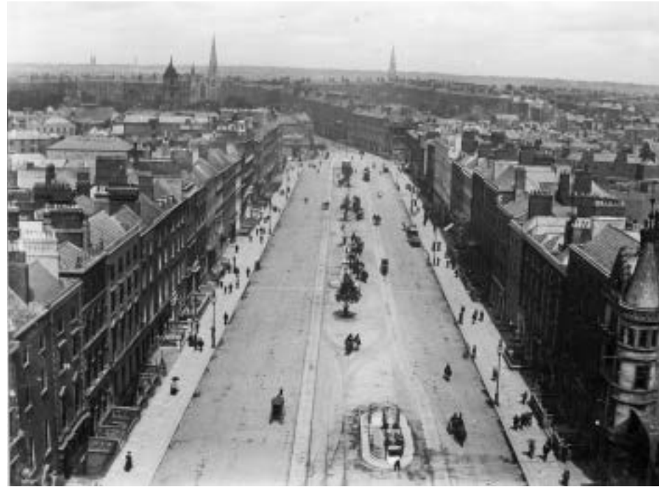
O'Connell Street, Upper, viewed from Nelson's Pillar, c.1890 IAA Photographic Collections, 12/29V13