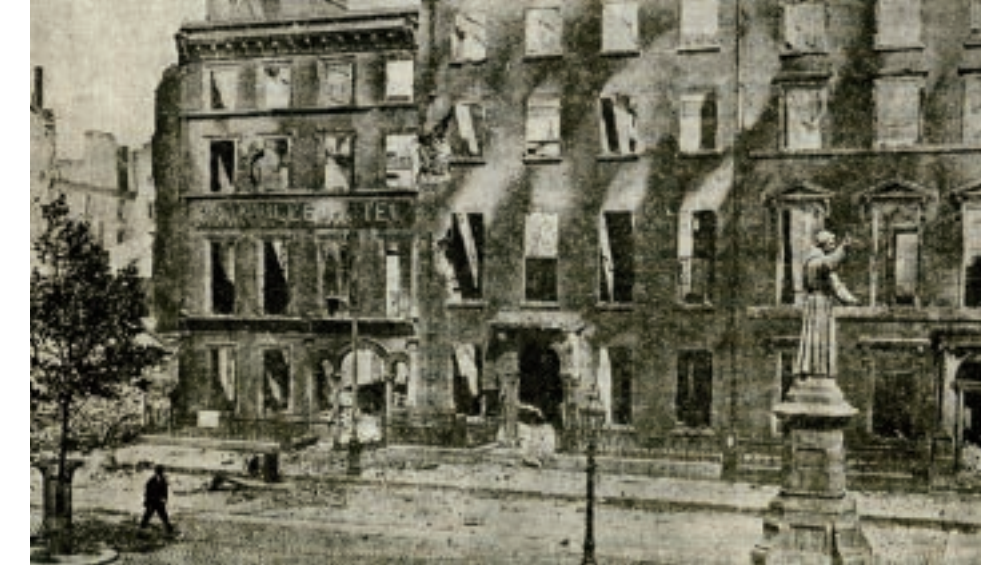
Granville Hotel and temporary GPO, viewed from offices of the Irish Builder, July 1922 Irish Builder, 15 July 1922, p. 498