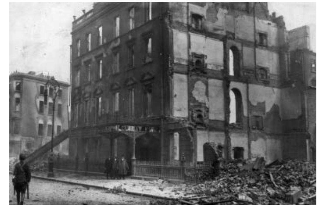
Gresham Hotel, July 1922 IAA Photographic Collections, 72/12X1